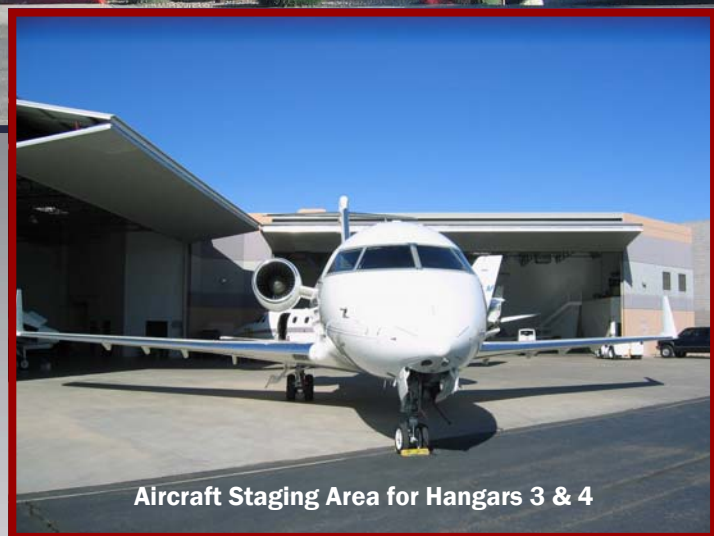
Aircraft Staging Area for Hangars 3 & 4

Fits all CHALLENGERS, CITATIONS, and LEAR Jets